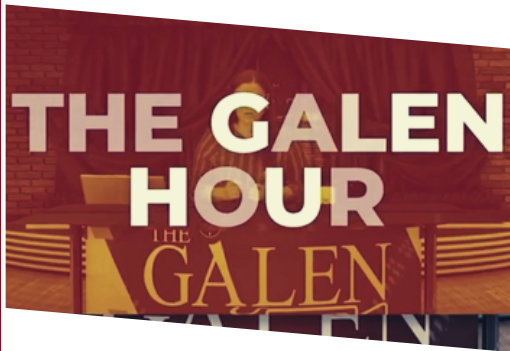
The Galen Hour Season Two