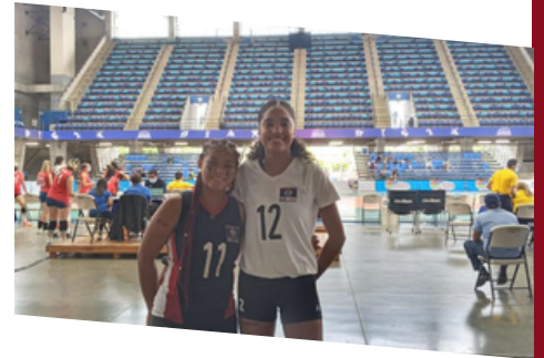
Lady Eagles represent Belize in the Central American Championships