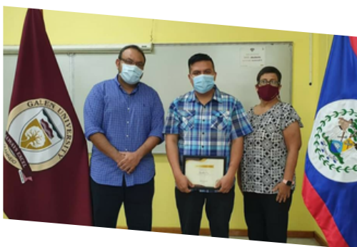
George Cadle Price Scholarship