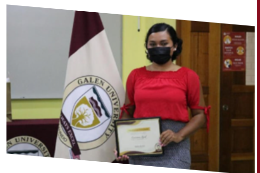
Dame Minita Gordon Scholarship